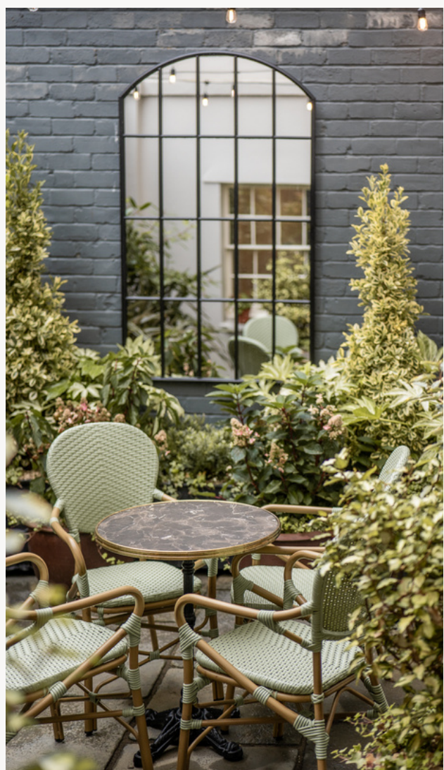
A PRIVATE GARDEN DESIGNED FOR LIVELY DRINKS AND GREAT COMPANY

The only room at No.131 with its own garden, the Garden Terrace Suite is made for those who like their getaways a little livelier. With a generous master bedroom, a charming twin room, and space to sleep four in style, it's perfect for couples, friends, or anyone chasing that 'host-with-the-most' energy.